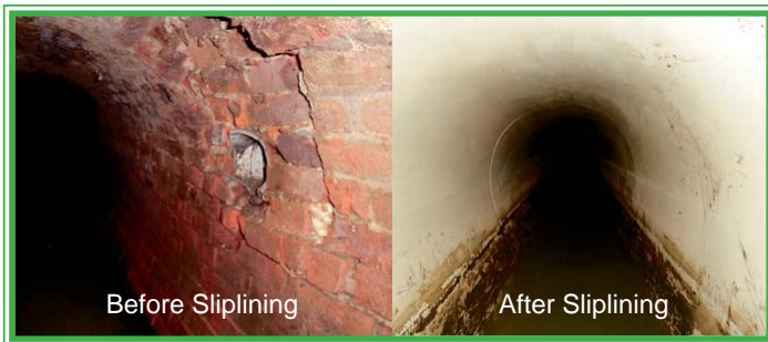
Thames Street Interceptor Rehabilitation Project

Continue to identify & implement the most cost-effective solution for reducing the number of CSOs to a level protective of Newport Harbor and acceptable to the community and regulatory agencies.