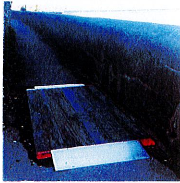
Figure 15: Cliff Terrace Platform