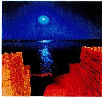
Figure 1: Cliff Walk 40 Steps by Thomas Freeman