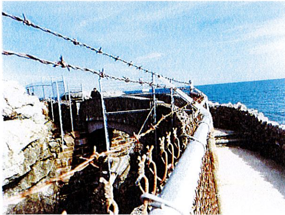
Figure 5: Rough Point Before