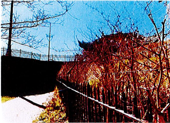
Figure 3: Tea House Before

Starting in 2020, the Commission has been working to eliminate all the barbed wire from the Cliff Walk. We feel the presence of barbed wire is unsightly and unwelcoming. We have made great progress and almost all of the barbed wire has been removed from the Cliff Walk. The Commission would like to thank the Newport Restoration Foundation for removing all of the barbed wire from around Rough Point. The Commission would like to thank the Preservation Society of Newport County for removing barbed wire from around the Chinese Tea House and Rosecliff. The Commission would also like to thank the owners of the Seacliff studio apartment for removing the barbed wire from their property.