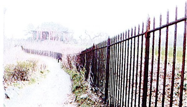
Figure 4: Tea House After