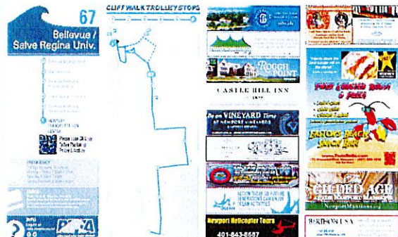
Figure 13: Cliff Walk Map - back panel