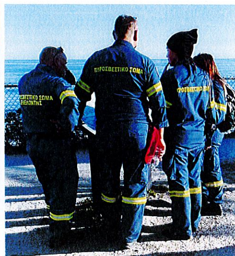
Figure 14: On the Cliff Walk