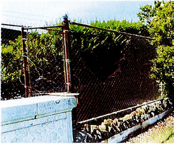
Figure 7: Rosecliff Before