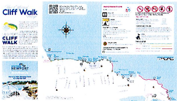
Figure 12: Cliff Walk Map - front panel