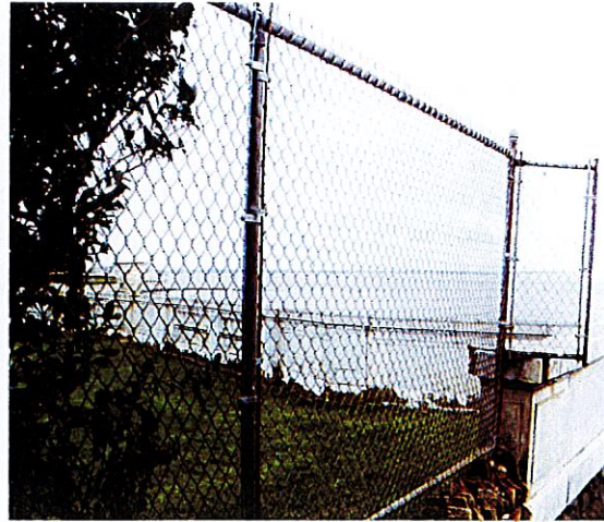
Figure 8: Rosecliff After