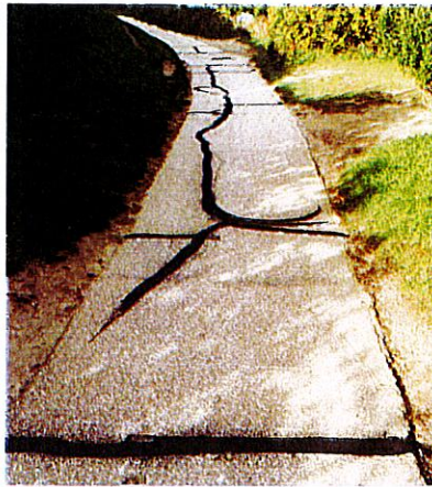
Figure 11: Crack Filling on Walk