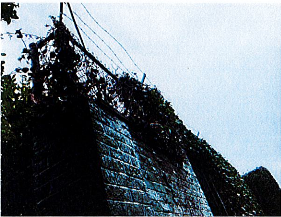
Figure 9: Seacliff Apartment Before