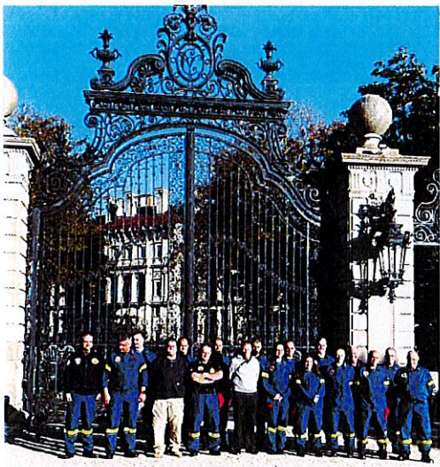
Figure 13: In front of the Breakers