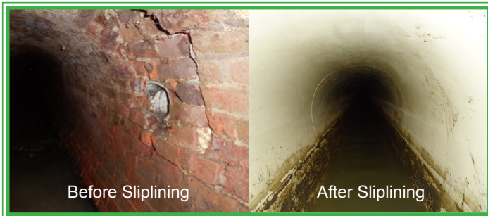
Thames Street Interceptor Rehabilitation Project

Continue to identify & implement the most cost-effective solution for reducing the number of CSOs to a level protective of Newport Harbor and acceptable to the community and regulatory agencies.