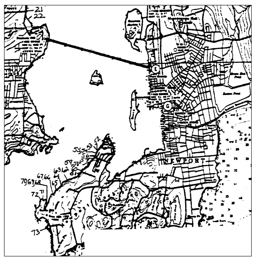
Figure 1. Actual and potential water pollution sources in Newport waters as determined by the RIDEM East Passage Shoreline Survey 1994 Report