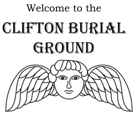
Owned and maintained by the City of Newport