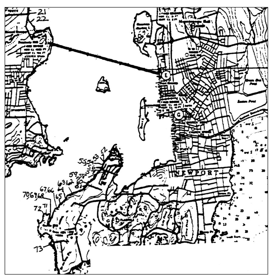
Figure 1. Actual and potential water pollution sources in Newport waters as determined by the RIDEM East Passage Shoreline Survey 1994 Report