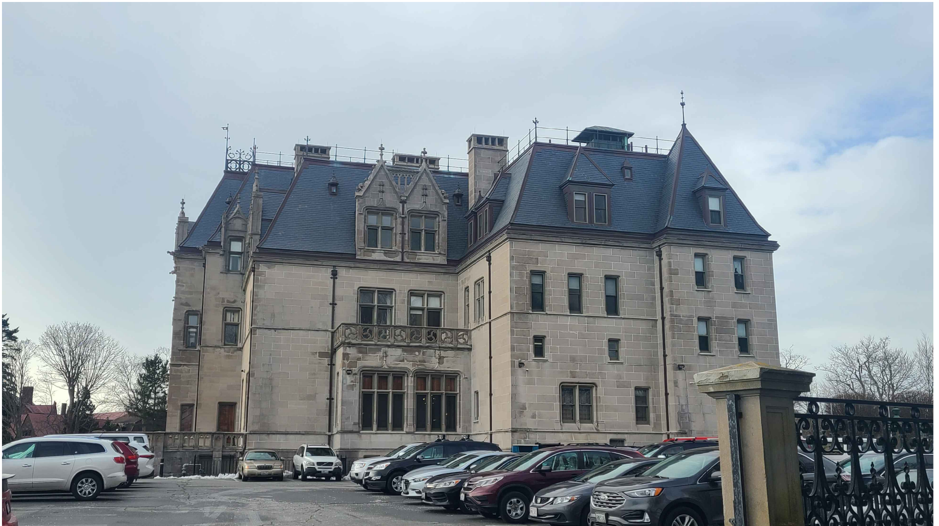
VIEW SOUTH FROM WEBSTER ST (EQUIPMENT NOT VISIBLE)