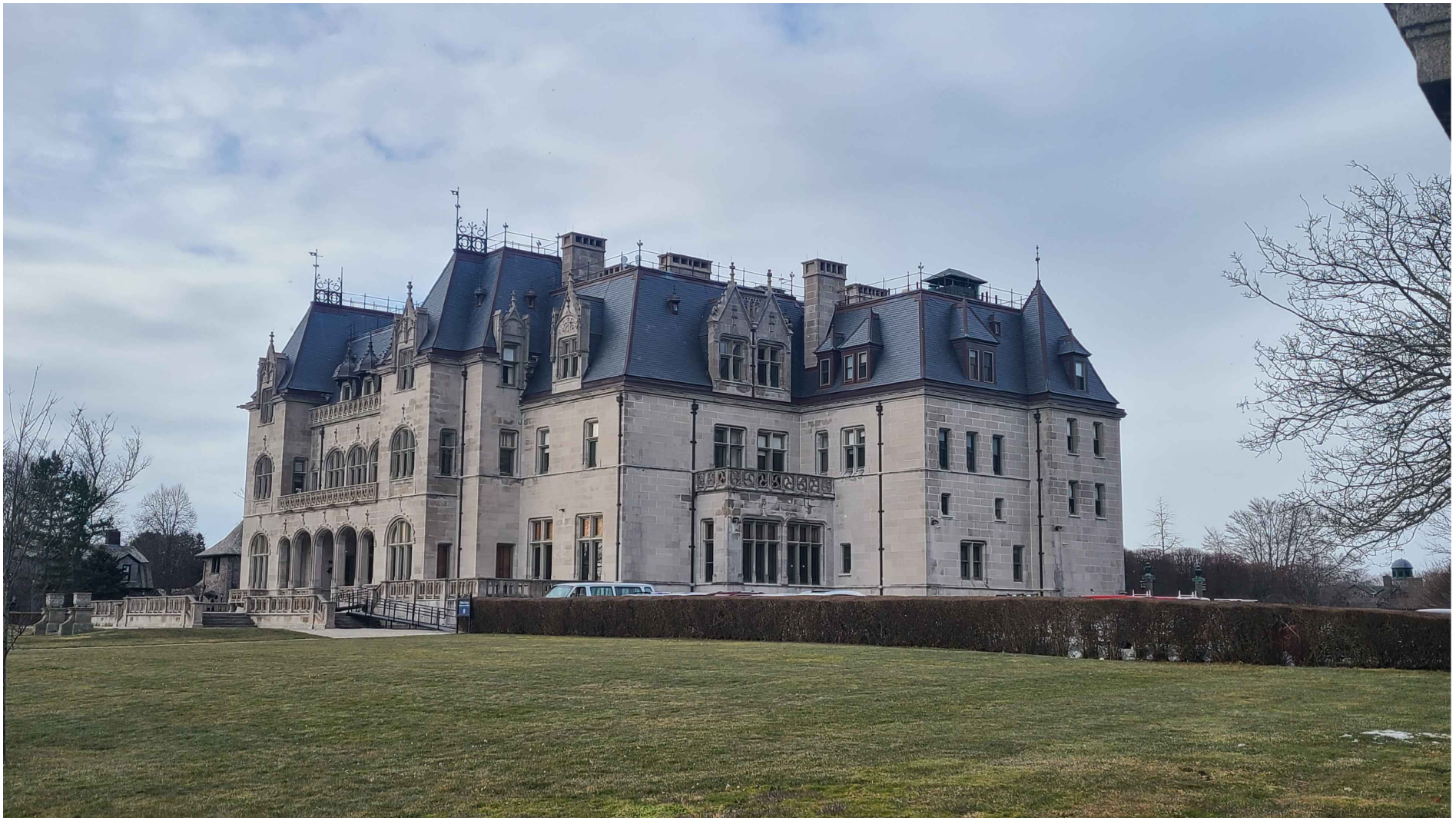
VIEW SOUTHWEST FROM CLIFF WALK (EQUIPMENT NOT VISIBLE)