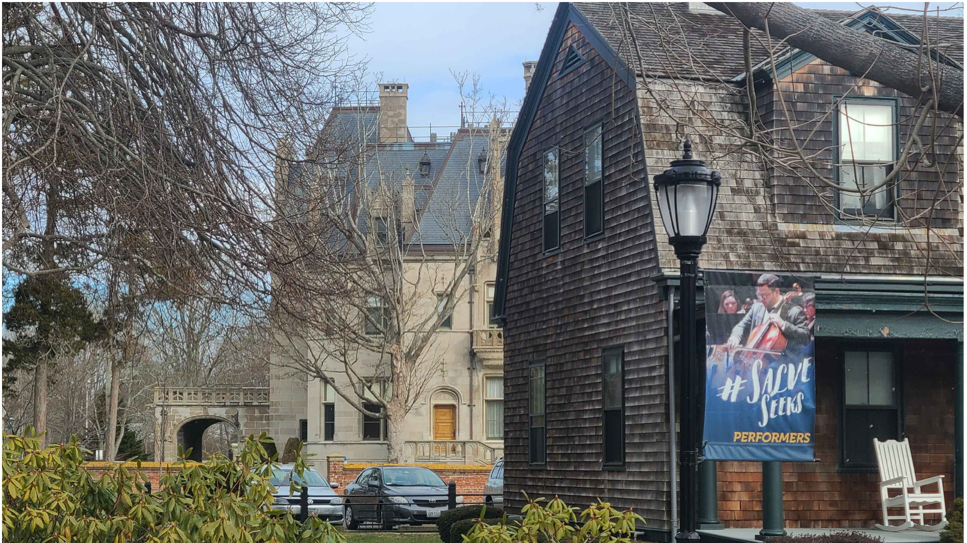
VIEW NORTH FROM OUR LADY OF MERCY CHAPEL