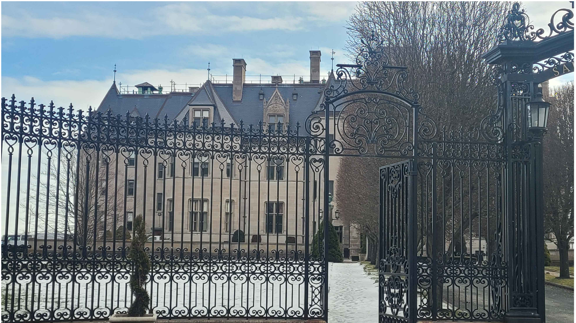
VIEW EAST FROM OCHRE POINT AVE