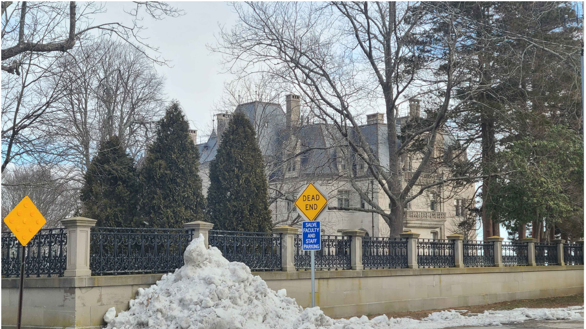
VIEW NORTHEAST FROM THE INTERSECTION OF LEROY AVE + OCHRE POINT AVE (EQUIPMENT NOT VISIBLE)