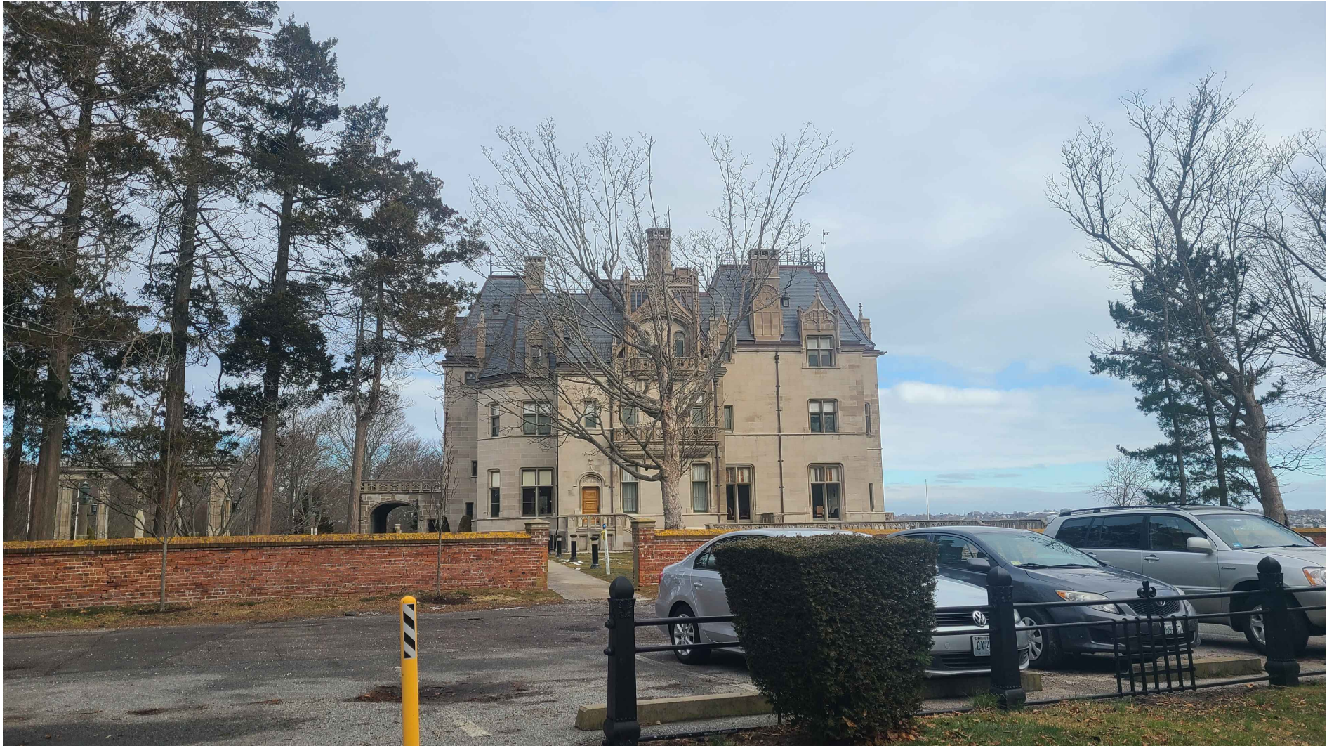
VIEW NORTHEAST FROM LEROY AVE (EQUIPMENT NOT VISIBLE)