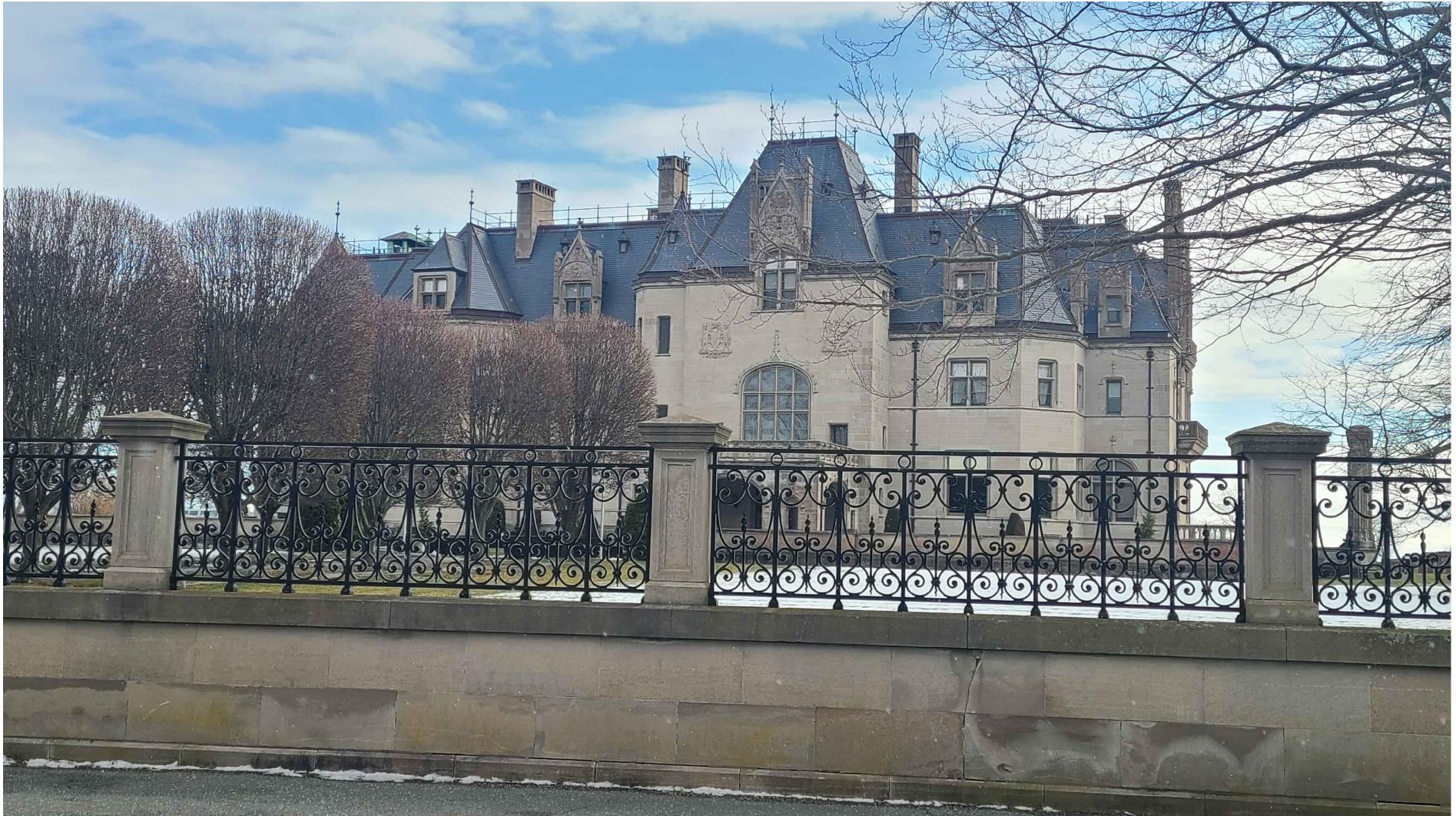
VIEW EAST FROM OCHRE POINT AVE