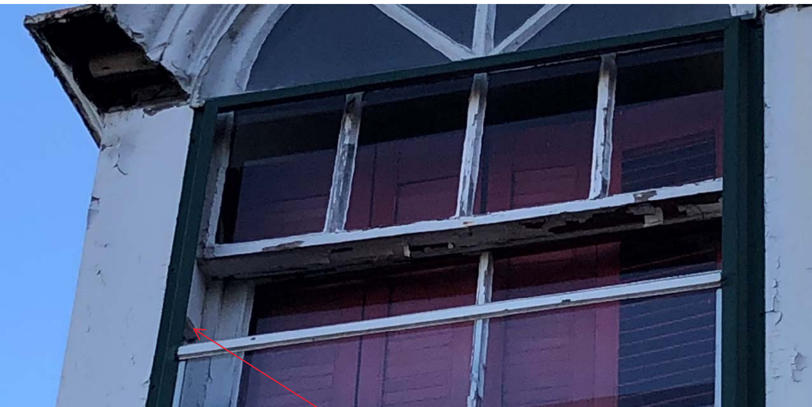
Block in window jamb holding upper sash closed